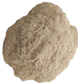
Fig. 1. The husk sample that has been ground and prepared for analysis

After the husking process was completed, the barley samples, which were passed through the sample cleaning device and cleaned, were ground in a hammer mill (Perten 3100, Huddinge, Sweden) with a 500 \mu pore size sieve and made ready for analysis (Figure 1).